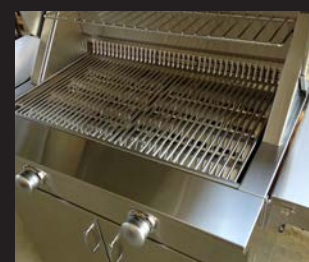
Interior view of the CGA35-2G shown, without rotisserie, interior, or control lighting