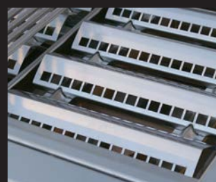
Ultra-even heat with the Caliber Patent-pending Crossflame™ radiant system

FOR MORE INFORMATION, VISIT OUR WEBSITE: CALIBERAPPLIANCES.COM