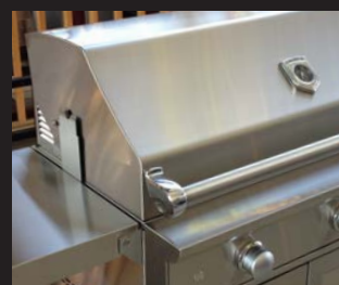
Professional Quality seamless welded construction