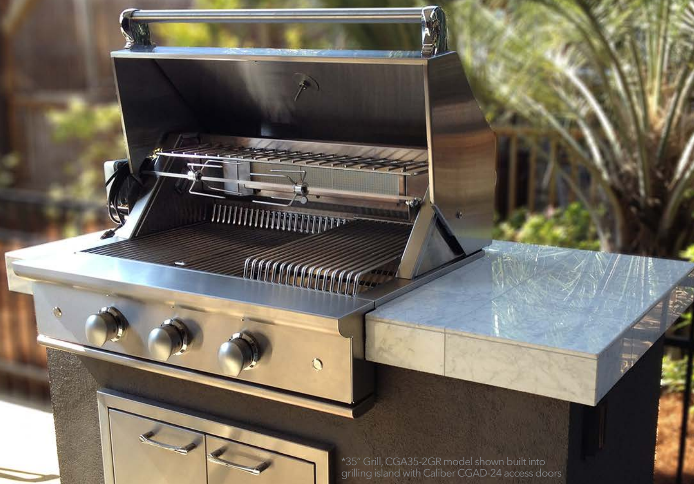
*35" Grill, CGA35-2GR model shown built into grilling island with Caliber CGAD-24 access doors